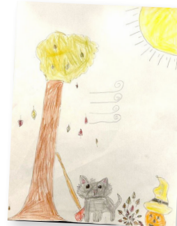
Zoey, age 10