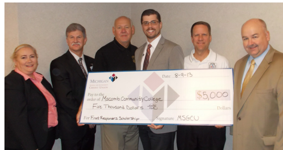
MCC Representatives accept a check from MSGCU for the launch of a First Responder Scholarship.

The addition of this program, along with our three other scholarships, means that MSGCU now awards more than $100,000 in scholarships each year.