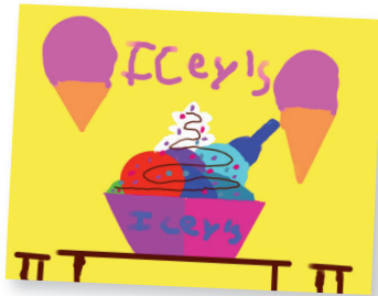
Hope, Age 10