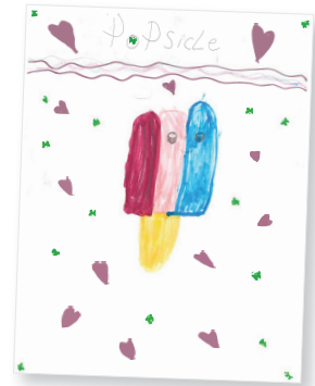
Isabel, Age 8